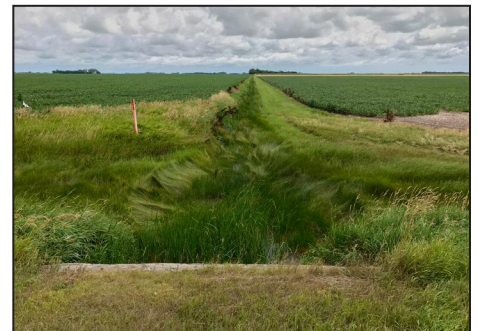
Left: A couple of miles south of the Clay-Wilkin county line in Wolverton Township, narrow buffers are visible in the upstream (east) view of Wolverton Creek. Middle: At a future buffer site, drowned-out crops border the stream channel. Right: Tall grass nearly obscures Wolverton Creek at Wilkin County Rod 3/170th Avenue in Mitchell Township, where the creek cuts a thin line between fields.