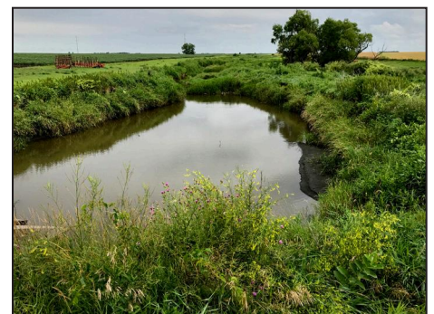
Left: Willow trees frame an upstream, easterly view of Wolverton Creek in Clay County’s Holy Cross Township, about an eighth-mile from the Red River. Along this 2.5-mile stretch, grant funds the Clay County Soil & Water Conservation District received in 2007 were used to remeander the stream.