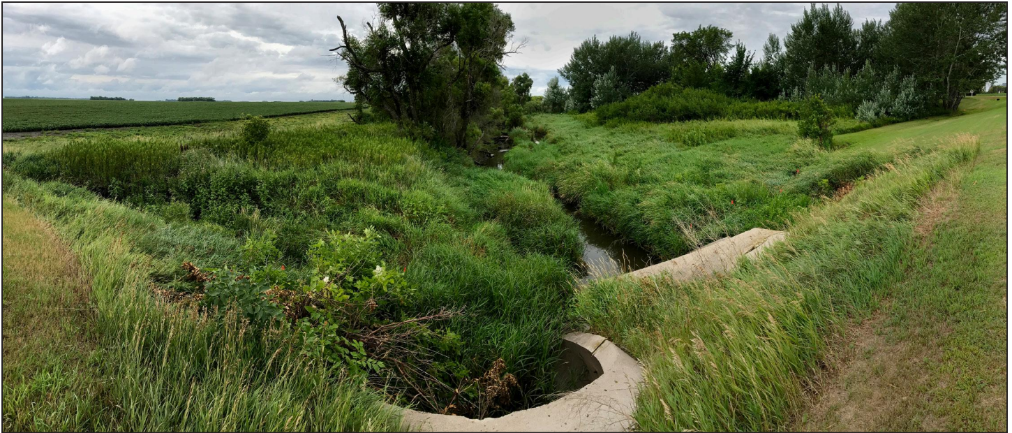
Straight east of Comstock, Wolverton Creek runs under Clay County Road 2 in Holy Cross Township. This is the downstream (north) view.

A third, $2 million phase would augment previous work – adding side-inlet culverts and buffers, clearing downed trees – starting at the outlet where Wolverton Creek cuts to the level of the Red River.